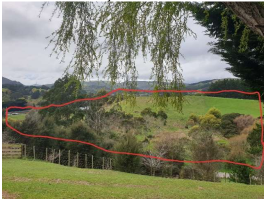
View from 42 Murphys Road of 10 Murphys Rd.

In particular No. 35 and 41 Murphys Road which are mainly hills and both of which have waterways/streams running through them. This part of Murphys Road is particularly affected by flooding when there is a major weather event.