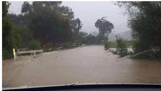
Flooding lower Murphys between 10 and 42

Added to these are No. 2 and 50 Flightys Road and No. 237 Paremata Haywards Rd, which also have a stream running through them and are prone to major flooding.